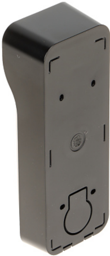
View after removing the cover from the mounting side: