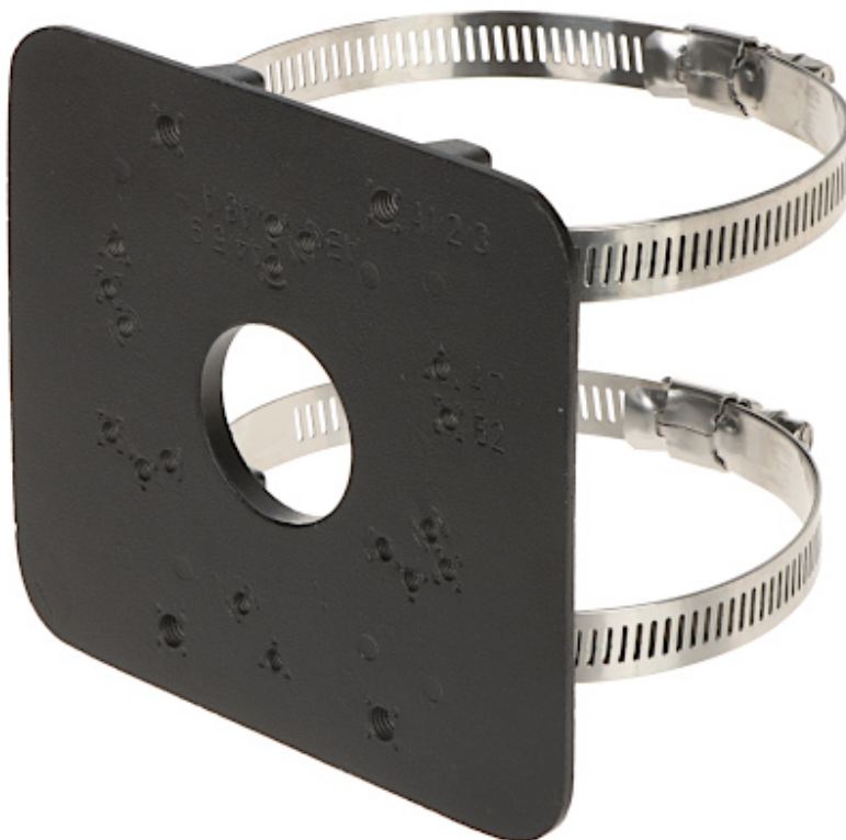
Mount designed to camera installation on a pole.

The device must be secured against contact with caustic, staining and viscous fluids.