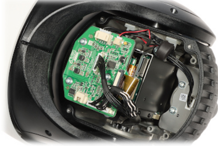
Micro SD card slot is located inside the camera: