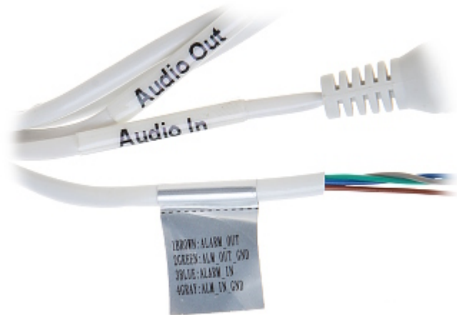
Example captures of device interface