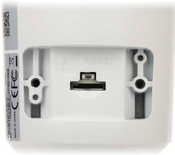
Camera mounting side view