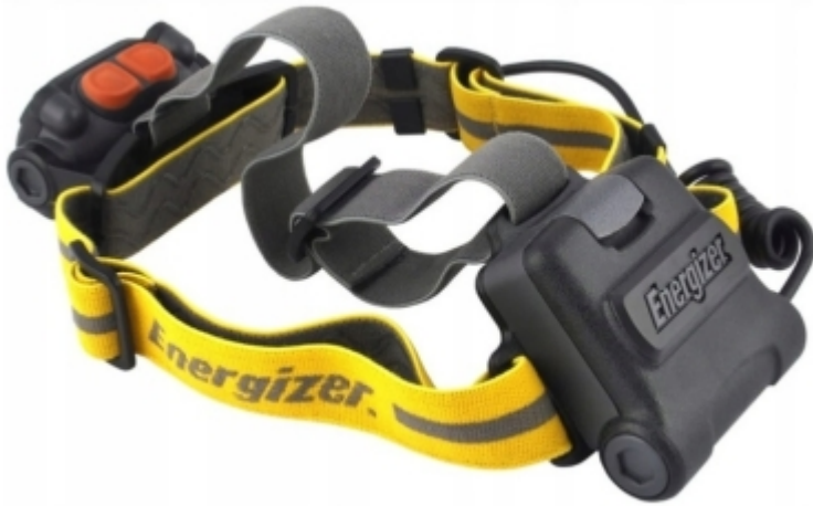
Examples of lighting modes