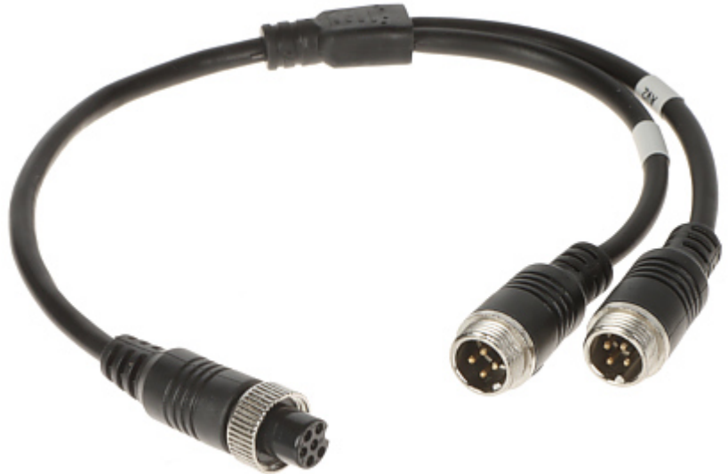
Connection cable terminated with M12, 6-pin plug and M12, 4-pin sockets.

The device must be secured against contact with caustic, staining and viscous fluids.