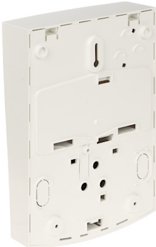
Internal view of the housing: