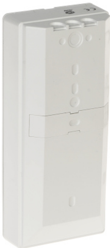
Detector inner view: