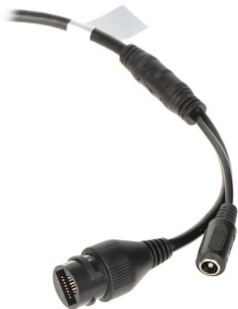
Camera and bracket dimensions: