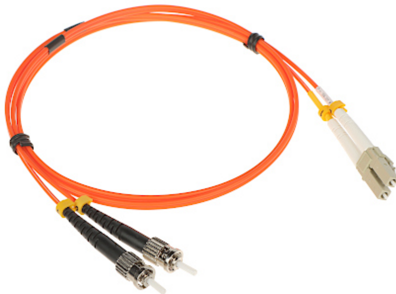
Multi-mode duplex OM2 patchcord with LSZH coating.

The device must be secured against contact with caustic, staining and viscous fluids.