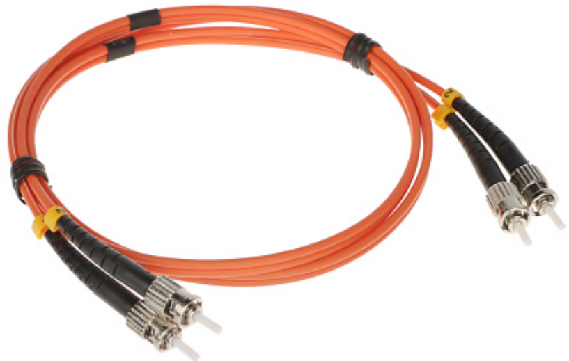
Multi-mode duplex OM2 patchcord with LSZH coating.

The device must be secured against contact with caustic, staining and viscous fluids.