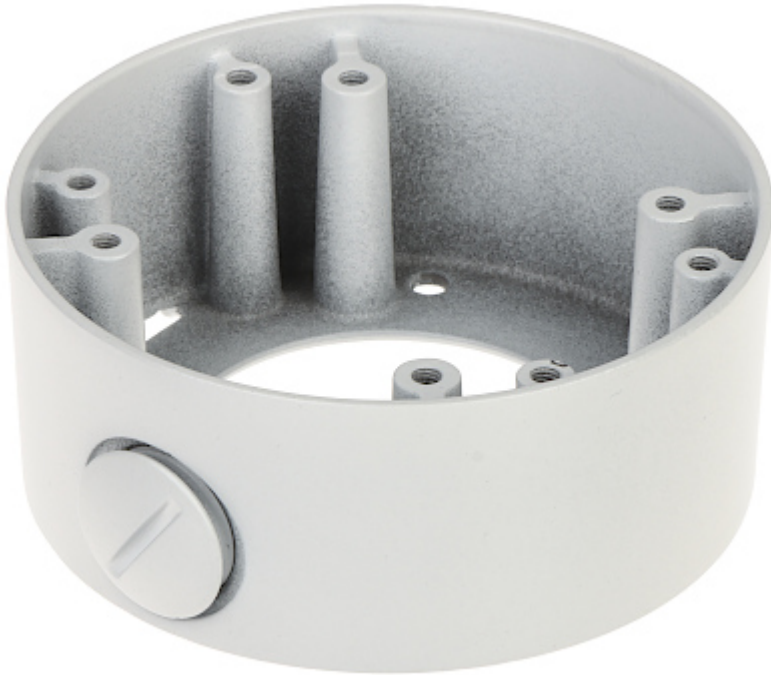
View of the ceiling mounting side: