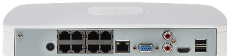
In the kit: