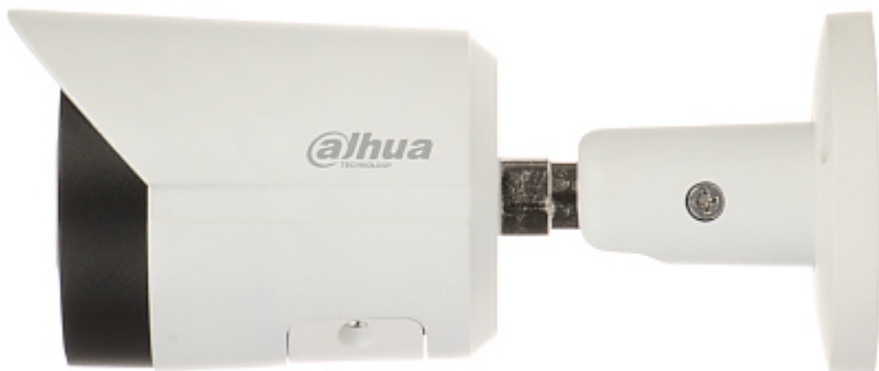
Memory card slot and "Reset" button: