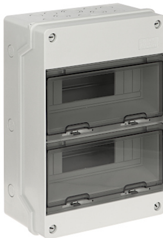
2-row 24-modular surface-mounting, hermetic distribution electric cabinet.

The device must be secured against contact with caustic, staining and viscous fluids.