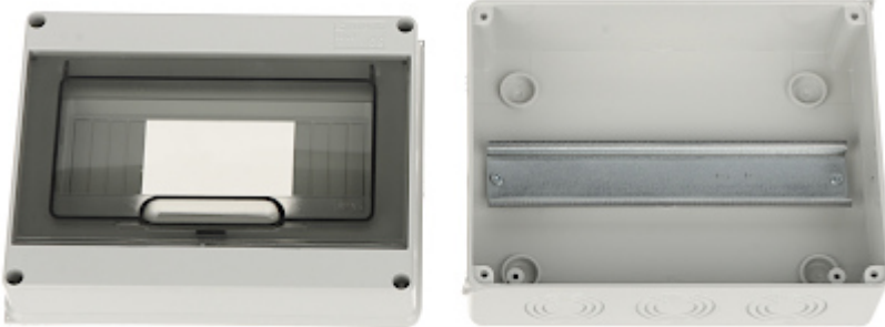
Wall mounting side view: