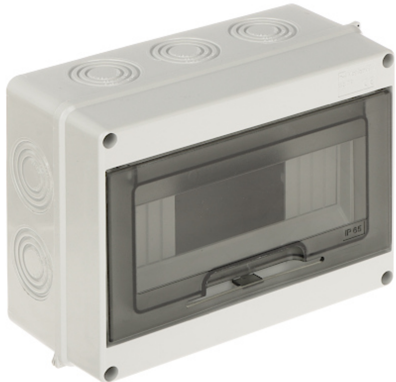
1-row 8-modular surface-mounting, hermetic distribution electric cabinet.

The device must be secured against contact with caustic, staining and viscous fluids.