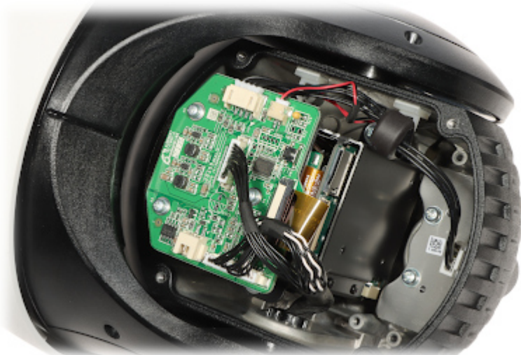
Micro SD card slot is located inside the camera: