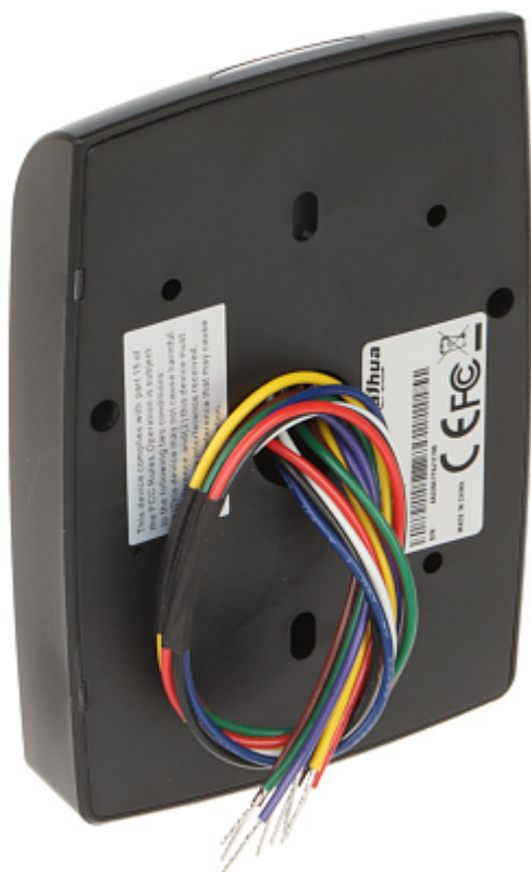
Internal view, after remove the cover: