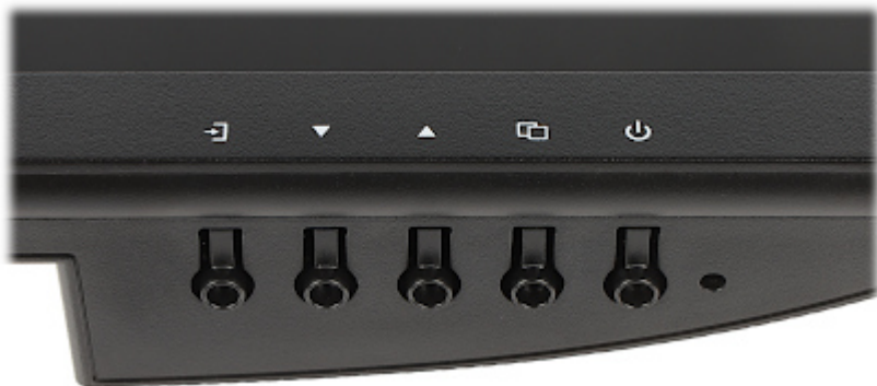
OSD menu control keys: