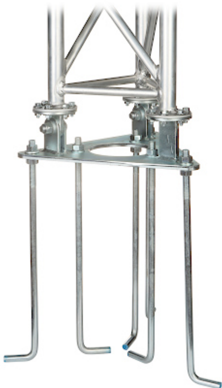
Method of mounting: