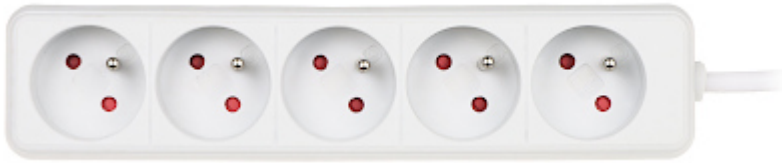
CEE 7/7 plug: