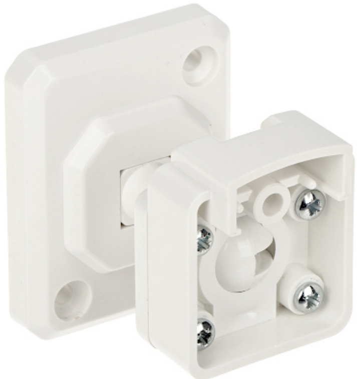
Bracket for motion detectors.

The device must be secured against contact with caustic, staining and viscous fluids.