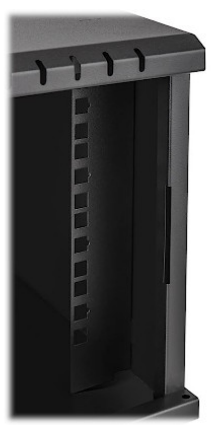
Hole for the fan: