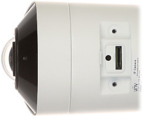
Mounting side view