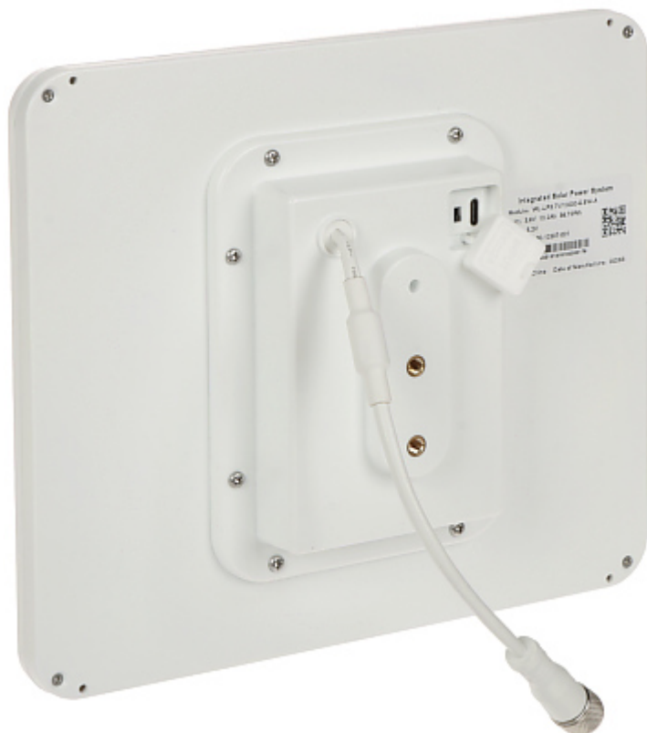
Charging socket and on/off switch: