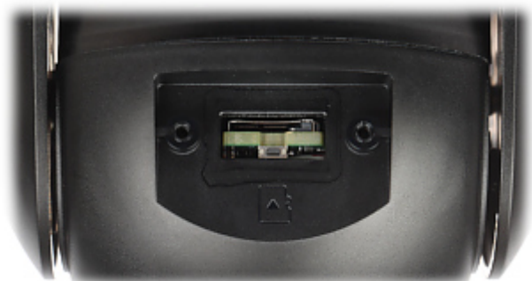
SIM card slot: