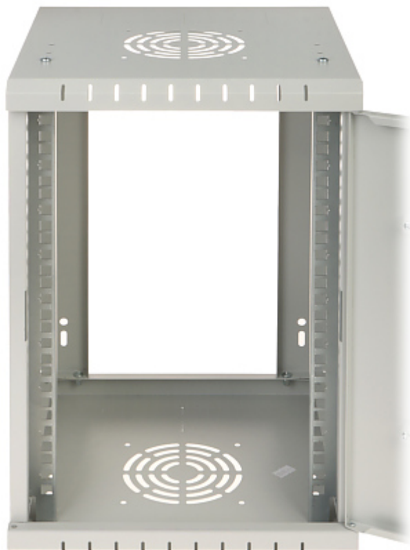
Hole for the fan: