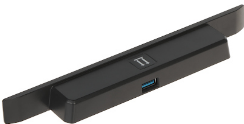
Dimensions with bracket: