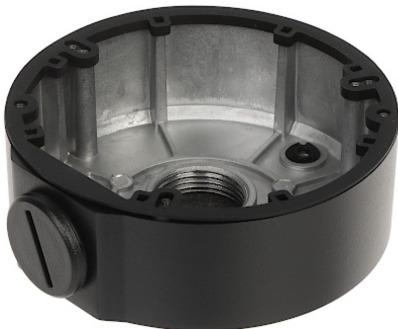
View of the ceiling mounting side: