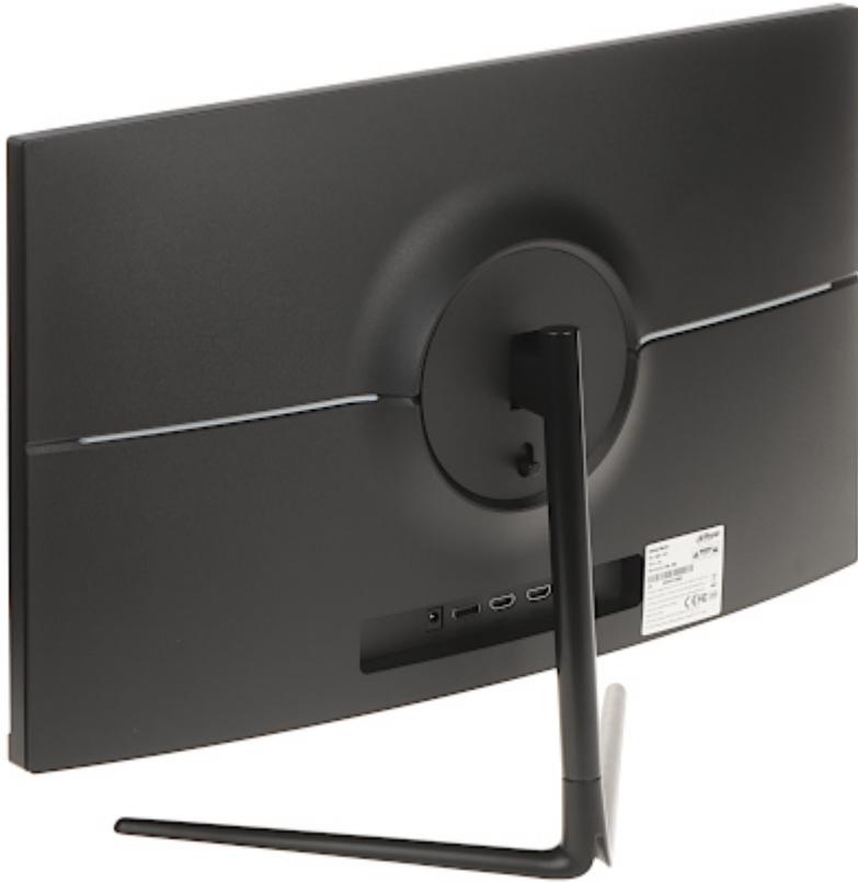
Bracket proper montage