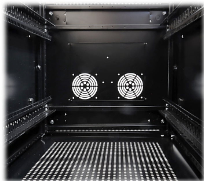
Cable entry in the floor: