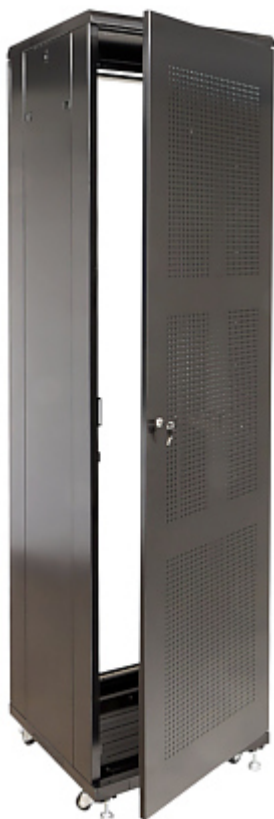
Holes for fans and cable entries: