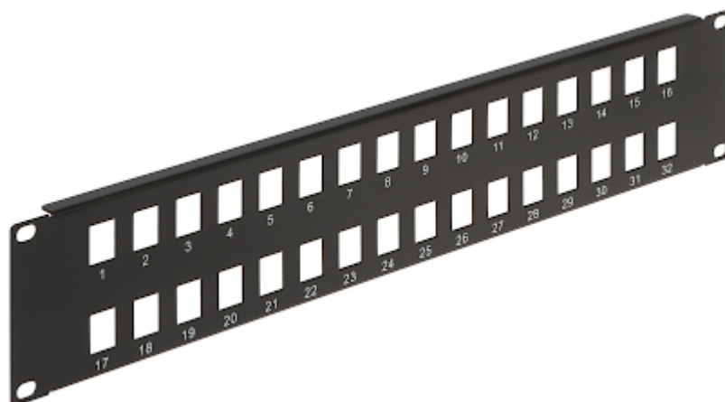
Patch panel for KEYSTONE connectors.

The device must be secured against contact with caustic, staining and viscous fluids.