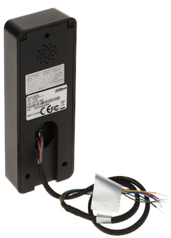
View after removing the cover from the mounting side:

User Manual Code: ASR2101H-D PROXIMITY READER WITH KEYPAD ASR2101H-D DAHUA