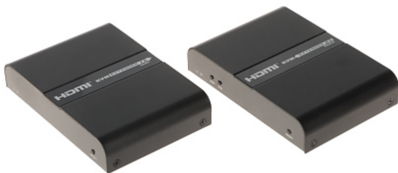
Transmitter and receiver connectors: