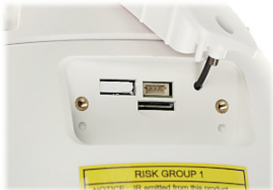
View after remove the cover: