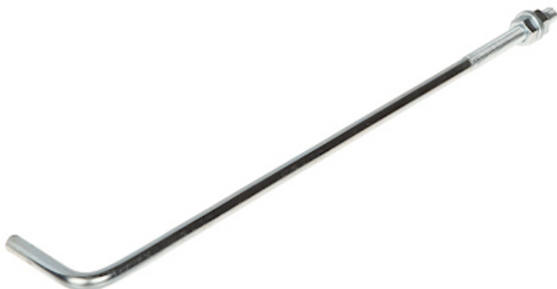
Method of mounting: