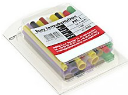
The set of heat-shrinkable tubing.

The device must be secured against contact with caustic, staining and viscous fluids.