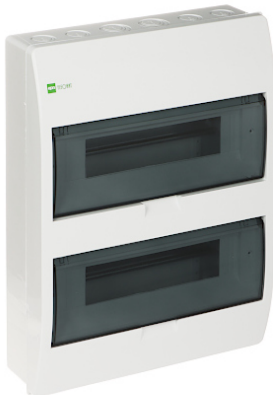
2-row 24-modular surface-mounting distribution electric cabinet.

The device must be secured against contact with caustic, staining and viscous fluids.