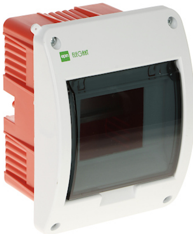
1-row 5-modular flush-mounting distribution electric cabinet.

The device must be secured against contact with caustic, staining and viscous fluids.