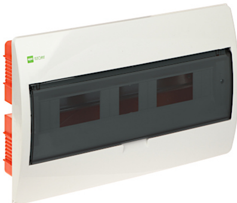
1-row 18-modular flush-mounting distribution electric cabinet.

The device must be secured against contact with caustic, staining and viscous fluids.