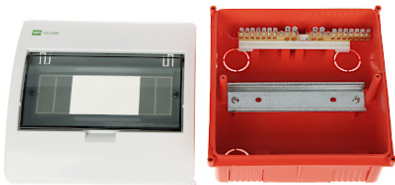
Connecting terminals view: