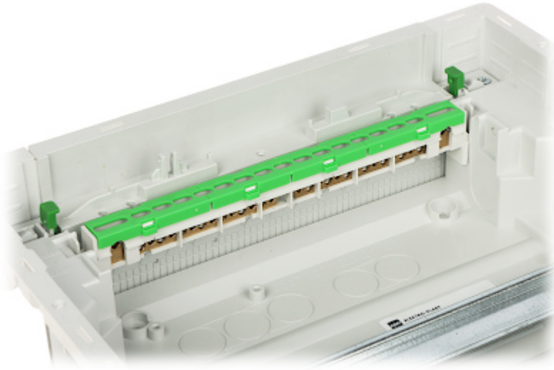
Mounting side view