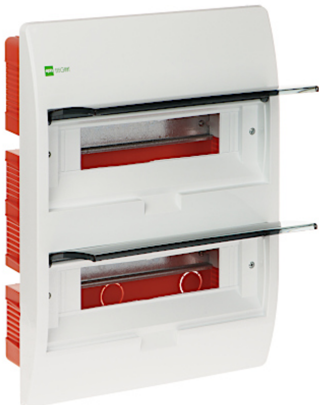
Connecting terminals view: