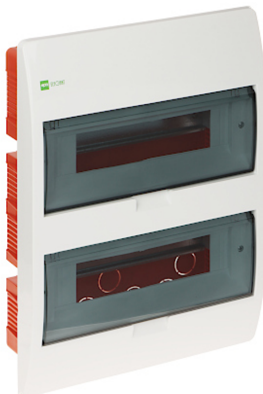
2-row 24-modular flush-mounting distribution electric cabinet.

The device must be secured against contact with caustic, staining and viscous fluids.