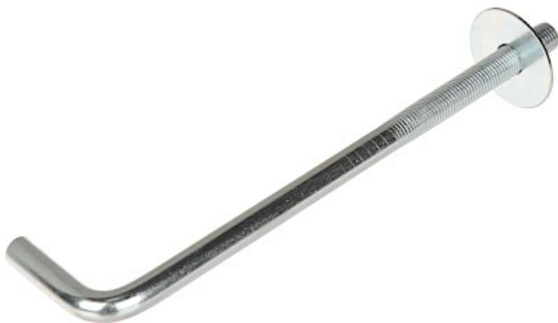
Method of mounting: