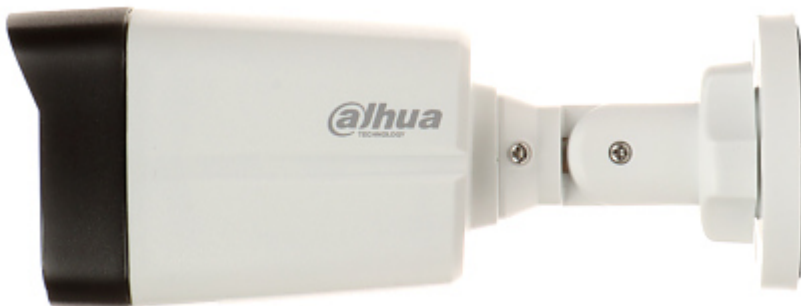
Camera mounting side view