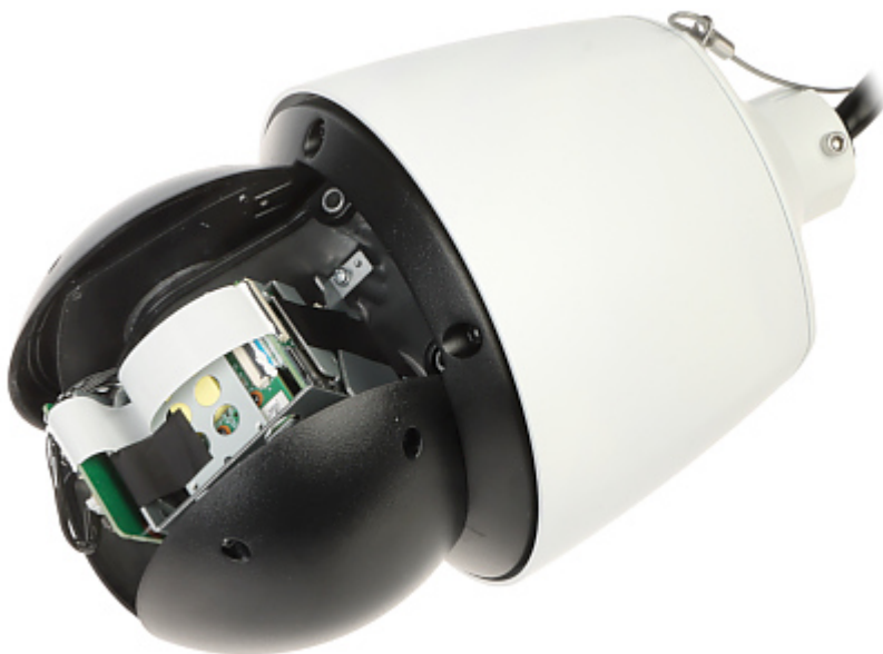
Micro SD card slot is located inside the camera: