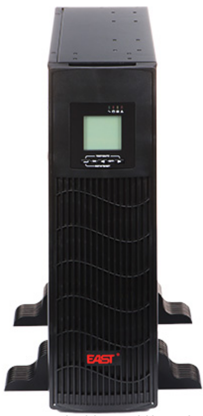
UPS is equipped with large readable LCD display:

User Manual Code: AT-UPS3000R-RACK UPS AT-UPS3000R-RACK 3000 VA EAST