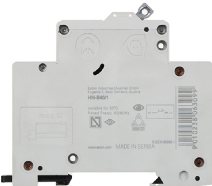
Mounting side view