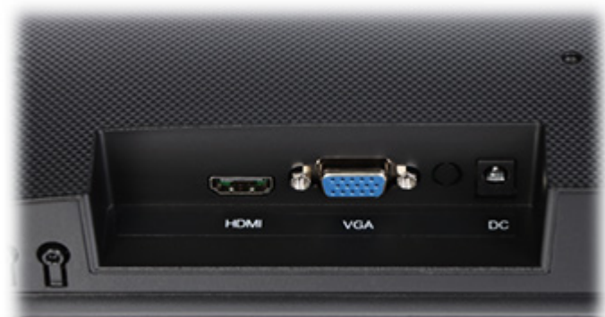
In the kit: