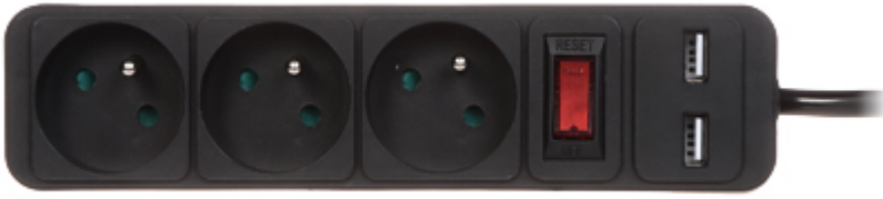
CEE 7/7 plug